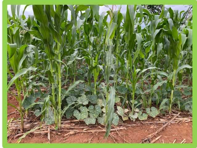
Healthy victory maize field using thick mulch and cover crops to protect the soil.