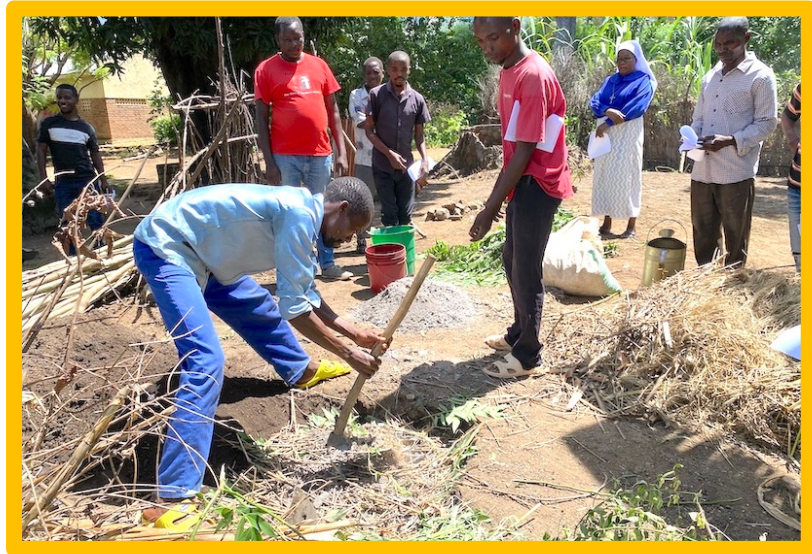
At a convent, F2F teaches parishioners and nuns how to create victory garden beds. F2F is partnering with churches and mosques to engage them as active leaders in the garden campaign.