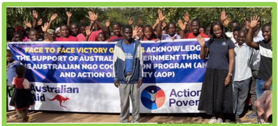
Right: Representatives from the Australian Embassy visit F2F's work in Malawi. Australian supporters also include The Charitable Foundation, the Australian NGO Cooperation Program (ANCP), Action on Poverty, and individual donors.