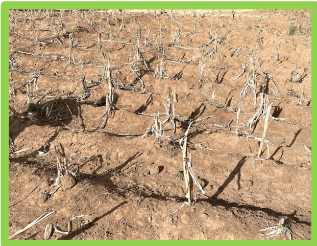
Stunted monoculture maize fields damaged by chemical fertilizers and pesticides.