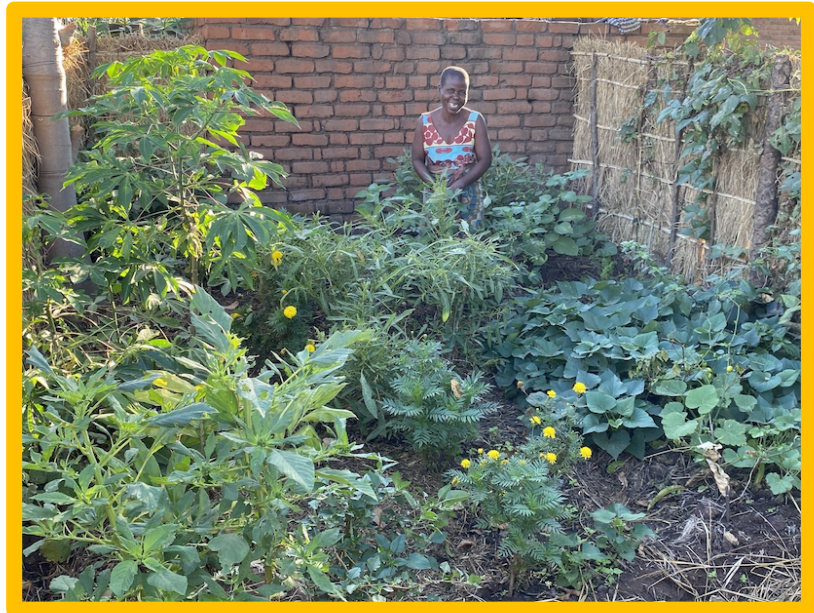
A productive garden includes a diverse variety of short-term and long-term plants. This garden above generates over $200 of income and savings each year.